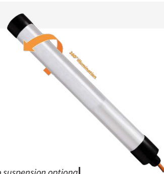
Silo suspension optional